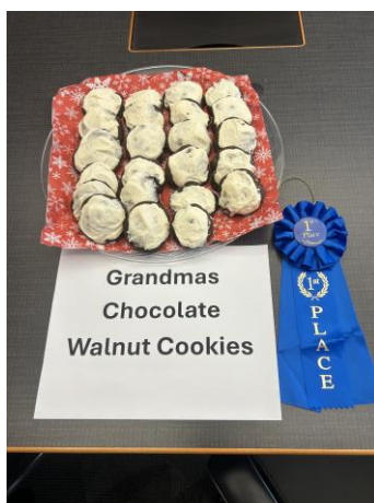
Grandmas Chocolate Walnut Cookies