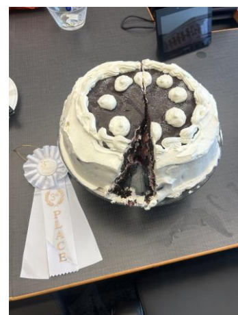
Third Place Becky Toth